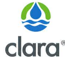
(KLAR-uh) gravity separator

Email: dashpac@aol.com www.dashpacific.com