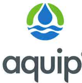
(uh-KWIP) passive media filter*