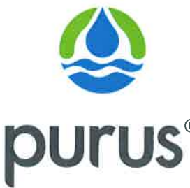
(PURE-us) stormwater polisher